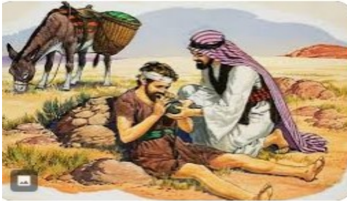
The Good Samaritan

Transforming lives and communities Knowing Jesus and making Him known